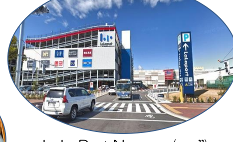
LaLaPort Nagoya (mall)