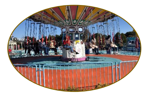
Graduation trip to Laguna Ten Bosch

April student entrance ceremony Incentive award Cherry-blossom viewing