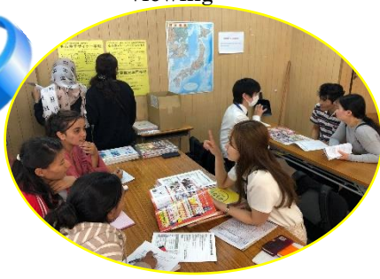
Higher education briefing session