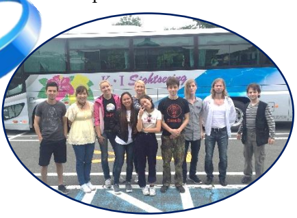
Visit to Mt. Fuji